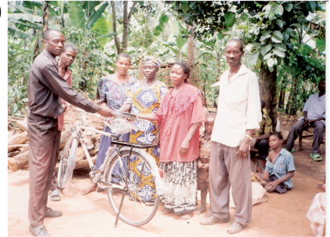
Staff present a bicycle donation to a parents group of CWDs, for easy mobilization of CWDs in their village.