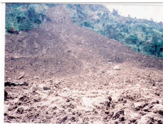
What remained of Nametsi village the scene of the Mud slides