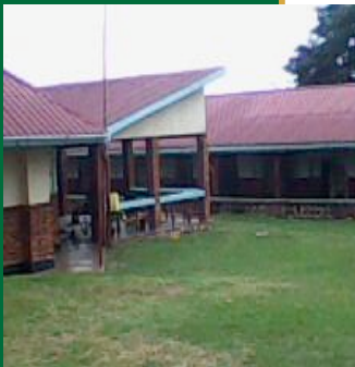
Section of the Home

There was not much mankind can do but pray to God for Devine intervention. The Papal Nuncio led mass at Bududa Parish to pray for the victims and the survivors. He was joined by Bishops and other brethren.