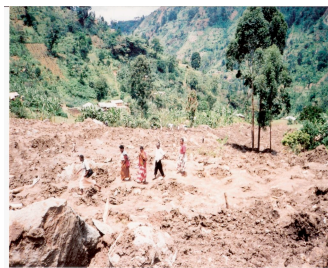
Staff of Butiru Cheshire home at the Mud slide site.