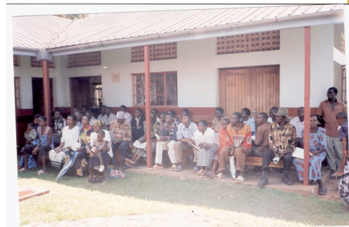
Parents of children with different disabilities attending outpatients clinic at the Home.

information management at the home and with other collaborators through establishment of a database.