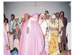
The Papal Nuncio to Uganda leading prayers at Bududa Parish. The staff of Butiru Cheshire Home Attended.